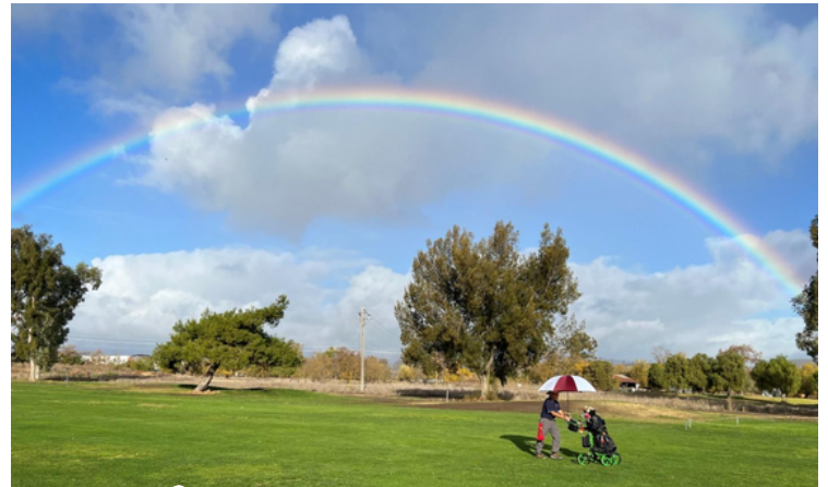
Rainbow after morning rain at Las Positas Golf Course on December 5, 2022.

What a memorable winter thus far in the Tri-Valley! Flooding shut down Sycamore Grove Park as well as Las Positas Golf Course. While we saw a good recovery from drought, we also experienced some air stagnation leading to several Spare-the-Air days the week before Christmas. However, the PM 2.5 standard was never exceeded in the Tri-Valley in 2022. And we're off to a good start in 2023 with the average PM2.5 AQI at 18 for January. There's a rainbow shining over us.